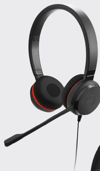
EVOLVE 20 SE